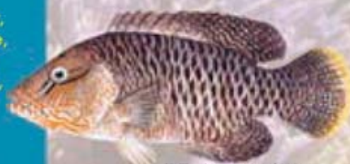
蘇眉 Hump Head Wrasse