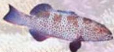
西星斑 Areolated Coral Grouper