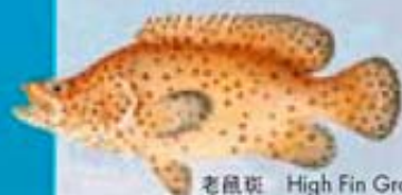
老鼠斑 High Fin Grouper