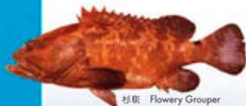
杉斑 Flowery Grouper