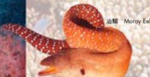
油鯧 Moray Eel