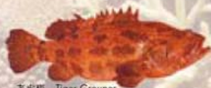
老虎斑 Tiger Grouper