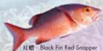
紅鰭 Black Fin Red Snapper