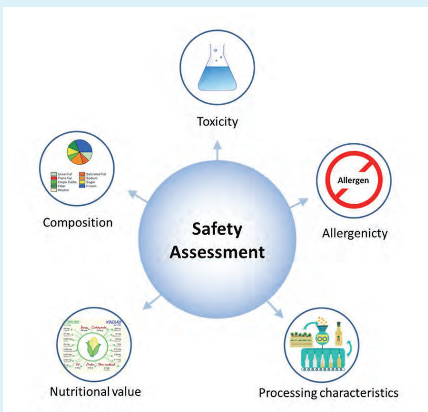
Figure 2. The safety assessment of GM food includes analyses of the transgenic proteins and their metabolites for potential toxic and allergic effects, compositional analyses and the evaluation of potential changes in the nutritional value and processing characteristics of the GM food.

For more information on GM food, please visit our website