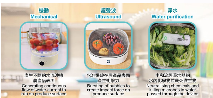
圖3: 部分蔬菜清洗機 Figure 3: Points to note when using running water to wash fresh fruits and vegetables