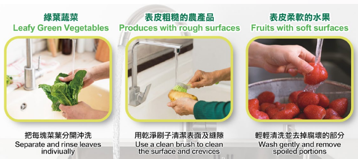
圖2: 以流動清水清洗新鮮蔬果時要注意的事項 Figure 2: Points to note when using running water to wash fresh fruits and vegetables

For machines utilising ultrasound technology, using improper frequencies may damage tissues and shorten the shelf lives of the produce. The bursting of unstable bubbles may generate shearing forces on the produce, thus causing damage of plant cells and leakage of cellular contents. These damages could lead to tissue softening and nutrient loss.