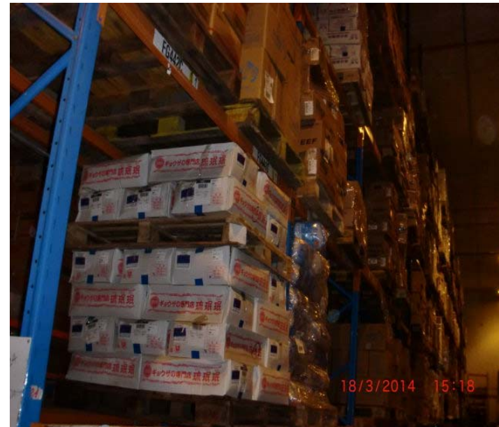
Importer's warehouse (apply to frozen or chilled foods)